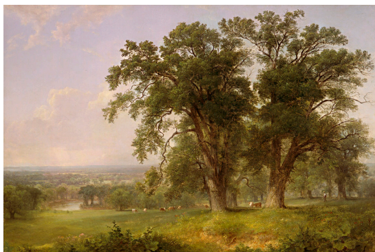
Asher Brown Durand (1796 – 1886)

Collection of the Memorial Art Gallery of the University of Rochester