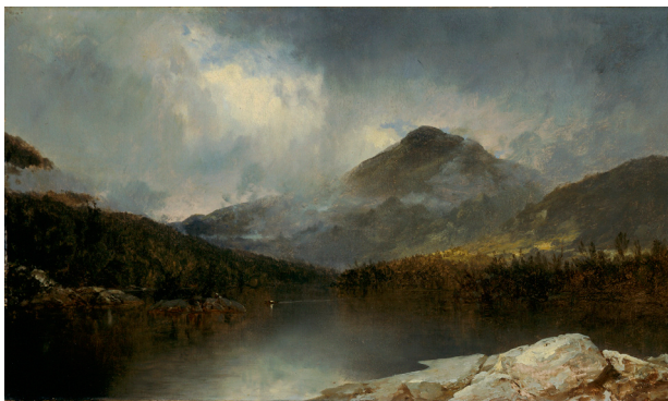
John Frederick Kensett (1816 – 1872)