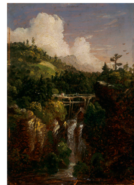
Thomas Cole (1801 – 1848)

Collection of the Memorial Art Gallery of the University of Rochester